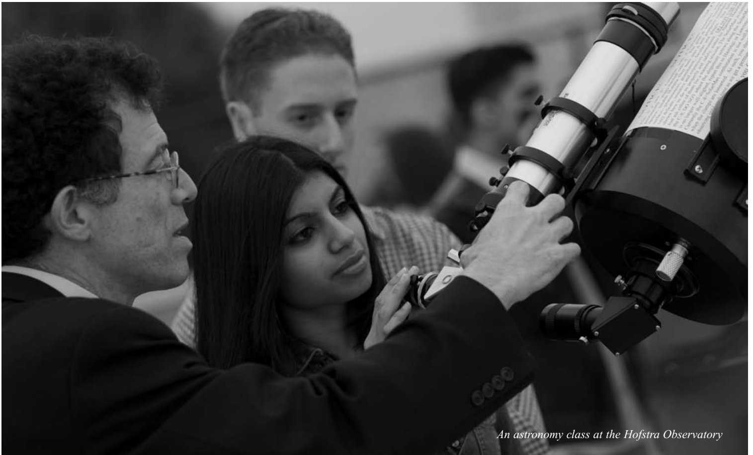
An astronomy class at the Hofstra Observatory

Thursday and Friday March 15 and 16, 2007