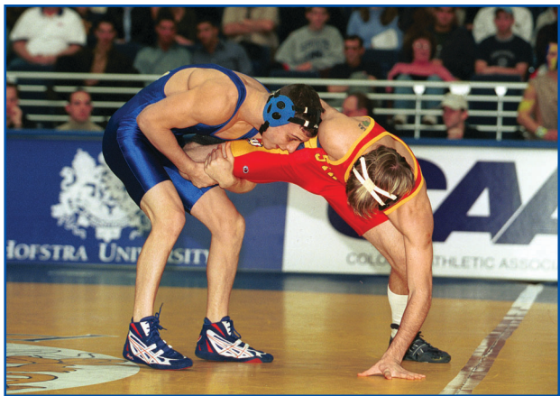
HOFSTRA UNIVERSITY ARENA