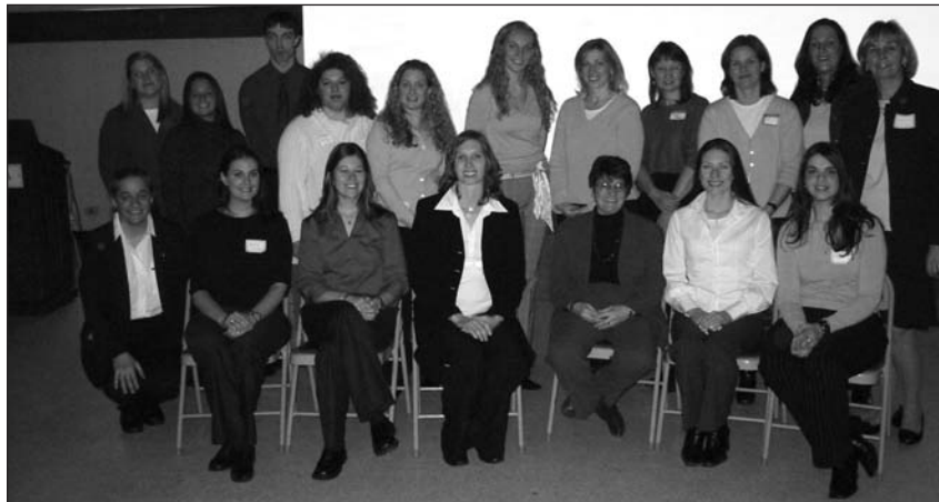
HNET presenters, 2005.