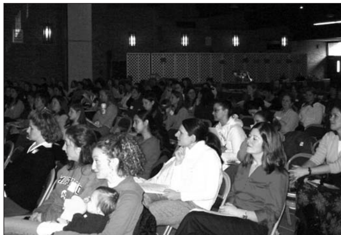
Attendees at the 2005 HNET conference.

All of these ideas were great examples of how to teach rich curriculum without teaching to the test. When a teacher promotes this type of learning and discovery, he or she is providing students with a real opportunity to learn. The most important idea I acquired from this workshop is that we as educators do need to teach skills necessary for testing, but we should not let our curriculum be overshadowed by it.