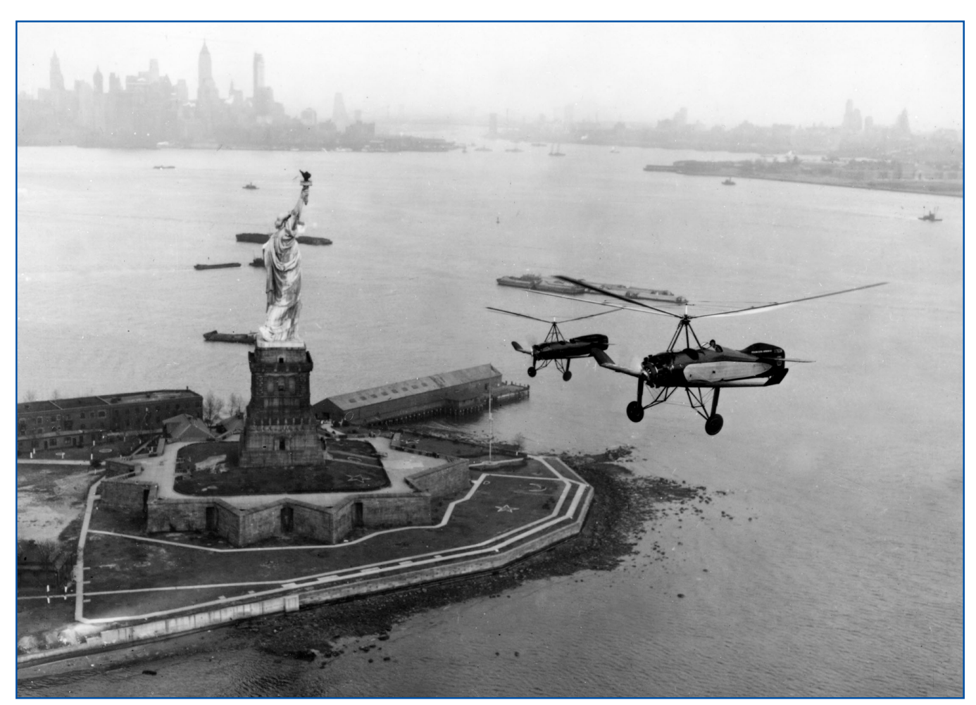
Pitcairn PCA-2 (foreground) and PCA-1B (background) Autogiros flying past the Statue of Liberty in a certification flight in October 1930.

helicopter, and even though Ciervalicensed Autogiros would be used by the British, French, American and Japanese forces, the Autogiro would all but disappear by the end of WWII. Few would know or remember that it was the English Cierva Rota Autogiros that would daily calibrate the coastal radars<sup>7</sup> that enabled the RAF to defeat the German Luftwaffe and win the Battle of Britain. The obscurity of Cierva's Autogiro would be mirrored by