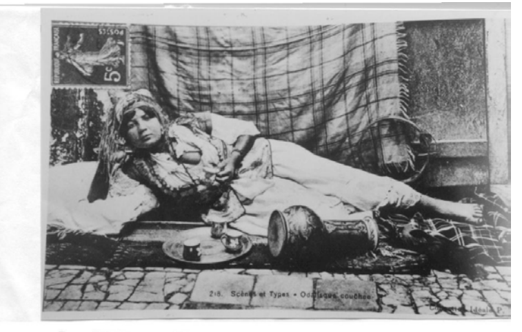
From Alloula 1986: 81)

The reading of the veil as a symbol of oppression originated in writings that depicted Muslim culture as inferior and backwards. Between 1800 and 1950, an estimated 60,000 books were produced about the Arab orient in the West (Hoodfar 8). The purpose of these books was to show colonized Muslims as underdeveloped and in desperate need of "help" from the West. These writings depicted Muslim women as imprisoned by barbaric Arab males, trapped in polygamous marriages, or forced to cover their bodies with the veil (Hoodfar 8). This reading of the veil as a symbol of oppression served to show how Muslim women were entrapped by a violent patriarchy, and their only way out was through the help and intervention of the West. The colonizers not only thought they were the ones that could save the women, but also believed that they could take over societies through the conquering of women (Yegenoglu 40). Women in this sense become the key to owning the society.