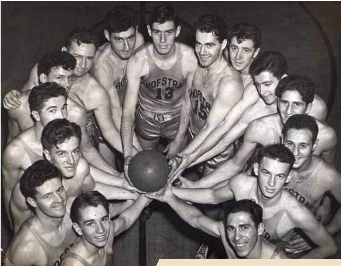
Hofstra students, c. 1940, courtesy of Hofstra University Archives

Students are encouraged to utilize the fitness facilities on campus, participate in the many programs offered, and live a healthy lifestyle. The beautifully designed, state-of-the-art Fitness Center is open every day.