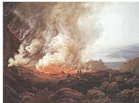
Johan Christian Clausen Dahl (1788-1856), Vesuvius erupting (1826).