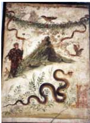
Bacchus and Mt. Vesuvius, Pompeii

Hofstra University Special Conference Advisor Dancing on a Volcano: A Cultural History of Naples