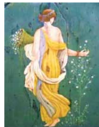
Image of the Goddess Flora Fresco from Pompeii