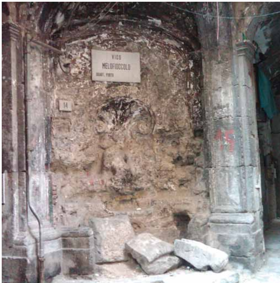
Fontana del Re from The Broken Fountain , Naples.