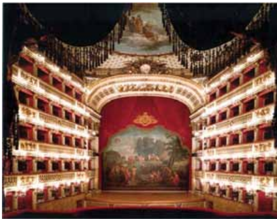
San Carlo Opera House Naples, Italy

Featuring students from the Hofstra University Department of Music