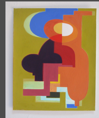
Untitled, Gouache, 9 x 12 inches, 2012.