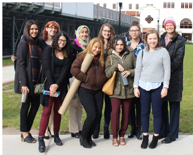
Students attended the Fall 2018 MSAAG Meeting in Montclair, NJ