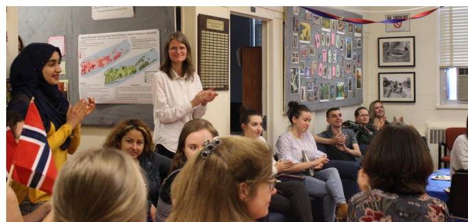
Attendees enjoying the Spring End of Semester Party

Visit our Flickr page to view photos from this event.