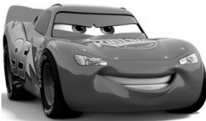
Car 2: Lightning McQueen