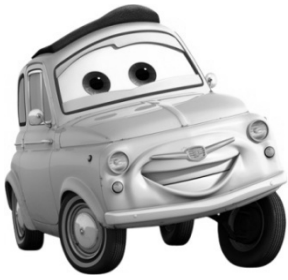
Car 3: Luigi