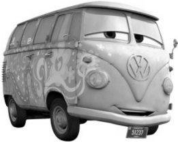
Car 1: Fillmore