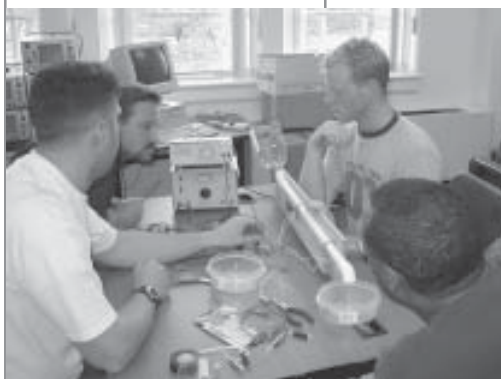
Students working in small teams

Assign students to small design teams (two to four students each) for addressing the challenge.