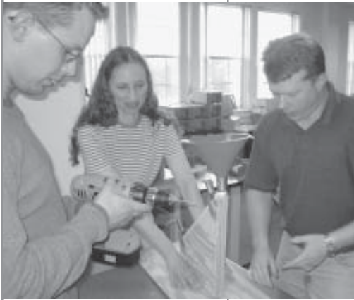
Students discussing a possible redesign

Facilitate team preparation of a class presentation of their work and final design. The use of computer presentation software and demonstrations should be encouraged. The engineering design documentation might include photographs, video recordings of the system in operation, and a description of the methods used to develop the system (see the NYSCATE Pedagogical Framework for a discussion of design presentations).