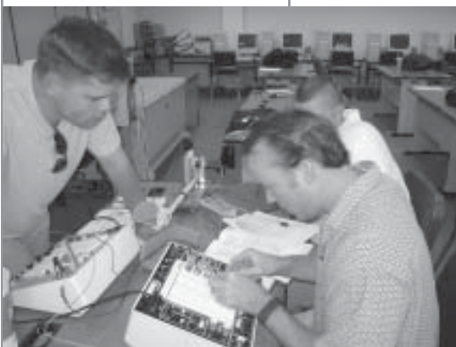
Students testing the packaging measuring subsystem