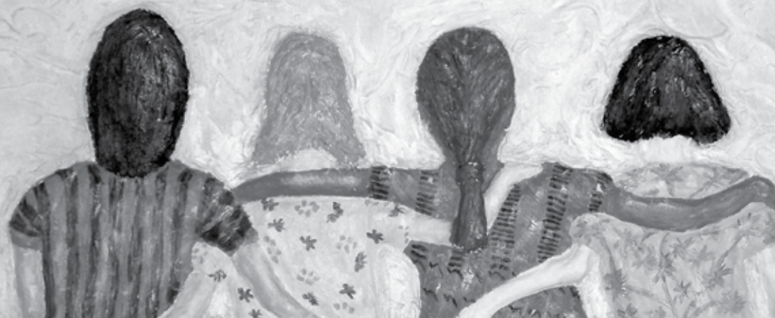
Horizons , 2008, Milt Masur, b. 1937, bas relief/collage, overpainted with oil, on panel.

From the Collection of Embracing Our Differences, Long Island: A Project of the Suffolk Center on the Holocaust, Diversity & Human Understanding, Inc.