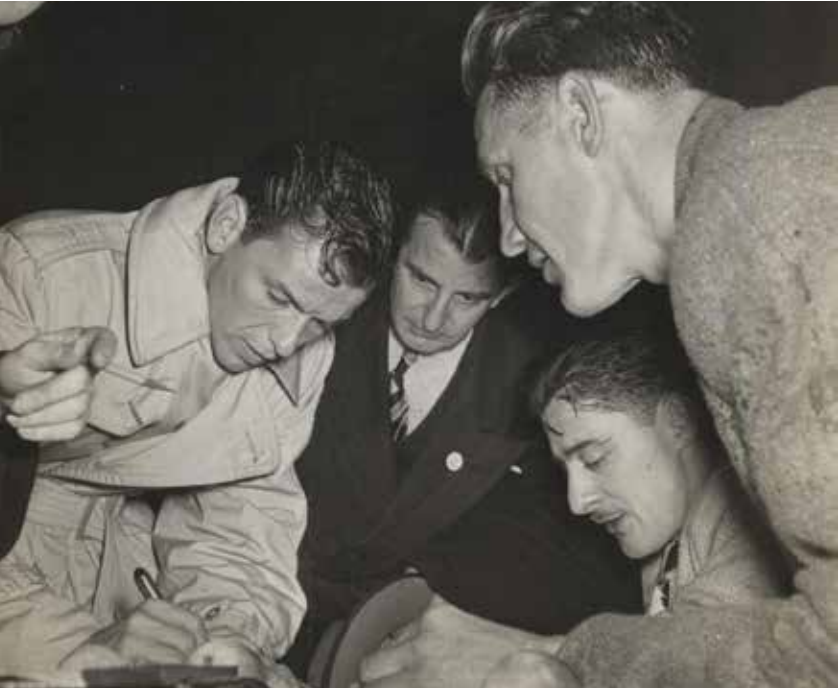
Frank Sinatra and fans at Hoboken City Hall, 1947

For more information, please call the Hofstra Cultural Center at 516-463-5669 or visit hofstra.edu/culture .