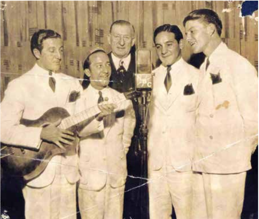
The Hoboken Four at a Major Bowes Amateur Hour radio broadcast, 1935

The Helene Fortunoff Theater, Monroe Lecture Center, California Avenue, South Campus