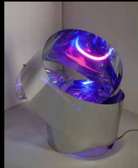
James O. Clark (American, born 1948) Reflective Moments , 2018 Clear vinyl, mirror Mylar, Plexiglas and argon light tube, 18x12x14in.