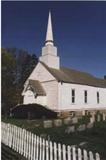
Searing-Roslyn United Methodist Church, Albertson, c.2000