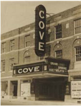
Cove Theatre, Glen Cove, 1927