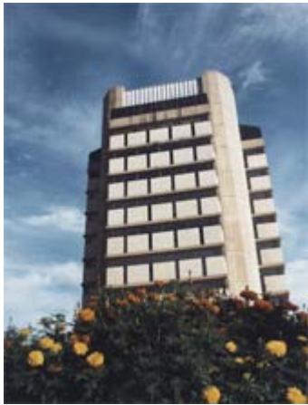
Joan and Donald E. Axinn Library, c. 1995