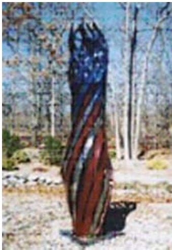
September 11 th Memorial Park, Setauket, c.2006